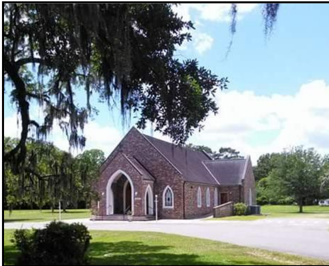
St. Timothy's Anglican Catholic Church

Our leisure time includes beach time at Folly Beach and Isle of Palms. We also frequent the lovely gardens and plantations just up from us on Ashley River Road, which is the oldest and most historic road in the state. We still love to cruise to Bermuda and the Caribbean. We also attend the symphony, concerts in local churches, etc.